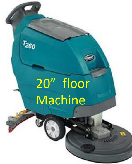
20" floor Machine